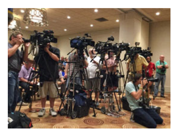
Unifor calls on Canadian Radio-Television and Telecommunications Commission for strong local multi-ethnic TV news.