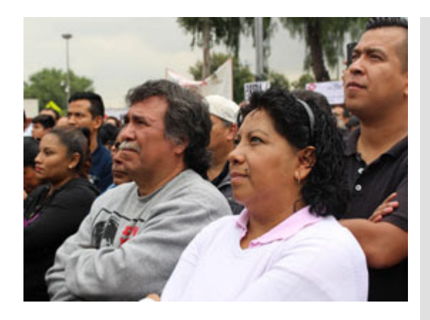
As NAFTA talks continue read about the Mexican worker demands for renegotiation that Unifor is supporting.